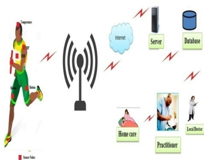
Example Scenario for Wireless Sensor Networks

health diagnosis. So using this technology for monitoring the patients and get fitness of our body.