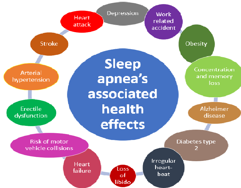
Figure 2 sleep apnea associated health issues

Another method of detecting the OSA has a home test involved by single-lead ECG, this method has been taken by the person who has the symptoms of OSA with a smartphone or other device like sensor will detect and store the pattern of breathing, limb movement, blood pressure, and snoring pattern