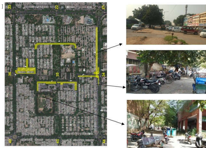
Figure 3. Identified pockets for Placemaking in Sector 35