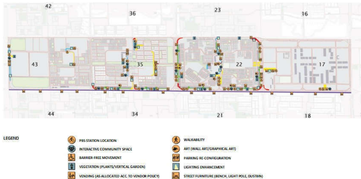
Figure 4. Existing pockets with holistic locations of proposed components throughout the study area

The figure 4 below gives a clear picture of the holistic locations of the components.